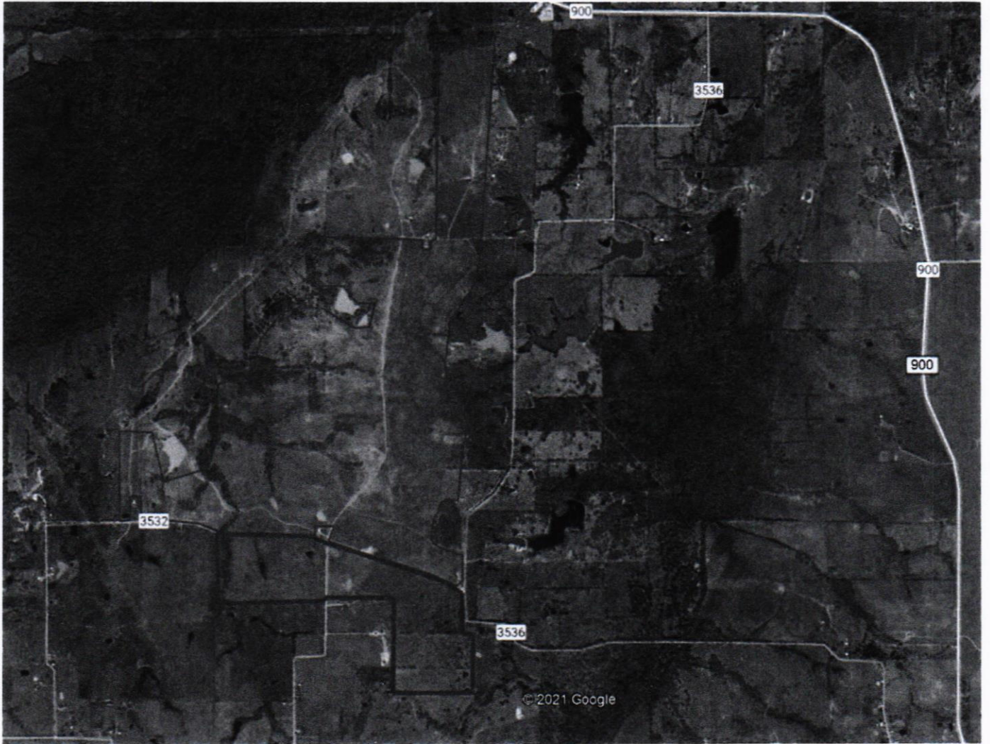
Exhibit B Map of Property